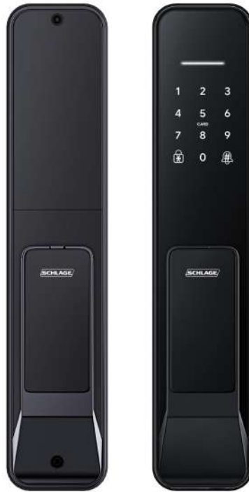
SCHLAGE S-8100 PUSH PULL DIGITAL DOOR LOCK (60mm) (WIFI VERSION)