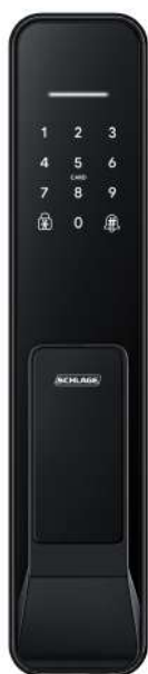
SCHLAGE S-8100 SERIES

Upgrade your home security with keyless convenience that not only looks sleek, it makes your home smarter!