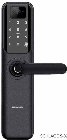
SCHLAGE S-3202 SERIES

Update your home's security with keyless convenience, that not only looks outstanding, it makes your home smarter!